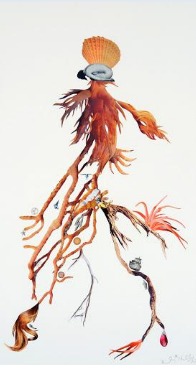
Dream of a common language in the disintegrating circuit (with thanks to Donna Haraway), Deborah Kelly